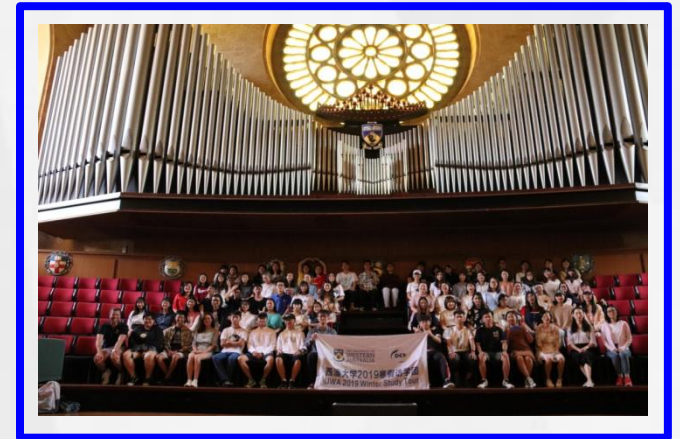
西澳大学2019年寒假访学项目