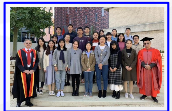
西澳大学2018年医学访学团项目